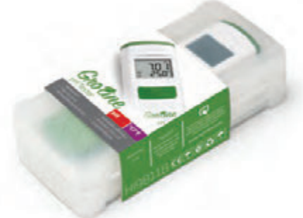
Supplied in a carrying case with buffer and cleaning solutions.

An easily removable cover provides access to the battery compartment.