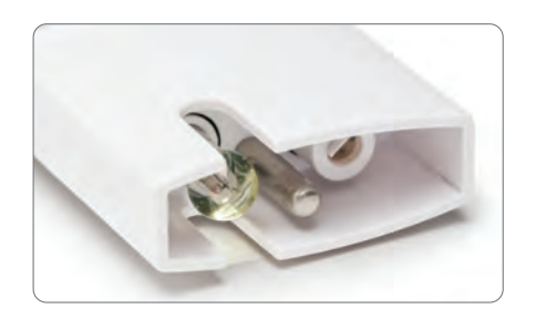
Exposed temperature sensor for faster response times

The GroLine HI98118 pH/temperature tester is our latest pocket meter for measuring the pH of a hydroponic nutrient solution. The HI98118 has a very large easy to read LCD display that shows both pH and temperature along with calibration, stability, and low battery indicators. All operations are simplified to two buttons.