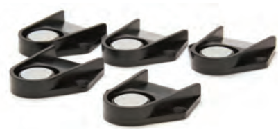
HI920005 Tag holders with tags (5)

Install tags near your sampling points for quick and easy iButton® readings. Each tag contains a computer chip with a unique identification code encased in stainless steel. You can install a practically unlimited amount of tags.