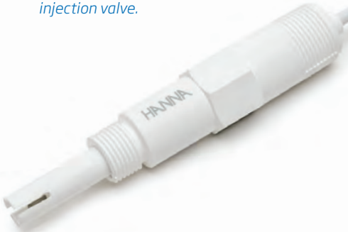
HI30033 EC/Temperature Probe

HI981413 is available in multiple configurations including a meter and probe option, a kit for in-line mounting, and a complete package that includes bypass loop and panel mounted flow cell. The kit for in-line and flow cell models include aspiration tubing with filter and dispensing tubing with injection valve.