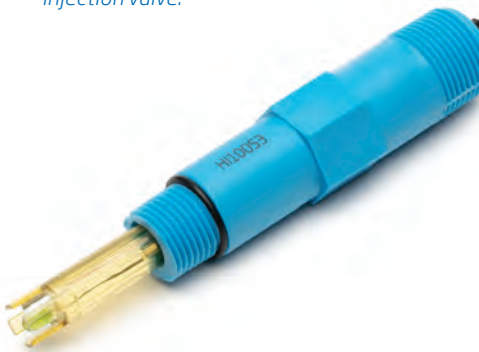
HI10053 Amplified pH/Temperature Probe

The BL100 is available in multiple configurations including a meter and probe option, a kit for in-line mounting, and a complete package that includes bypass loop and panel mounted flow cell. The kit for in-line and flow cell models include aspiration tubing with filter and dispensing tubing with injection valve.