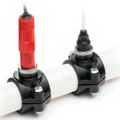
HI20083 ORP/Temperature Probe shown in-line

The BL101 is available in multiple configurations including a meter and probe option, a kit for in-line mounting, and a complete package that includes bypass loop and panel mounted flow cell. The kit for in-line and flow cell models include aspiration tubing with filter and dispensing tubing with injection valve.